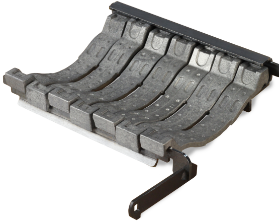
Figure 1: Bars shown seated on their comb outside the stove.

In stoves with a riddling grate system the bars should be seated with every other bar rotated 180 degrees, so the ends marked 'H' and 'L' alternate on each comb. When assembling the grate, fit bars to the low sections of the comb first by seating the ends marked 'L' onto the low part of the comb, whilst the ends marked 'H' should then be seated on the high sections.