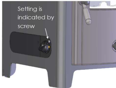
Figure 1: Setting the thermostat.