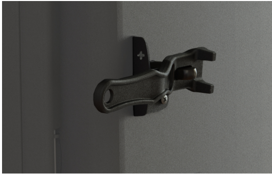
Figure 4: Riddling the stove using the supplied operating tool.