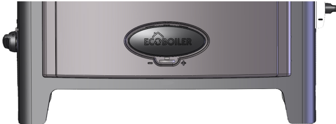
Figure 3: Easy Boost air control.

Always close the Easy Boost slider if the stove is to be left unattended. This is to allow the stove's automatic thermostatic control to function correctly - a crucial requirement to help prevent the water from boiling.